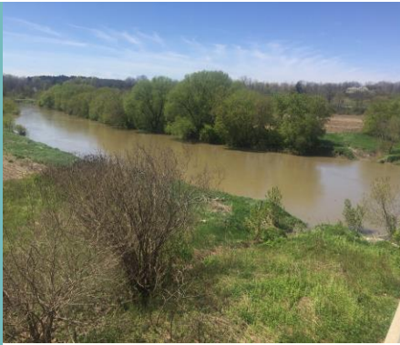
Picture of Deshkaan Ziibing Thames River COTFN